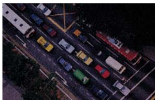
JVC Super LoLux™